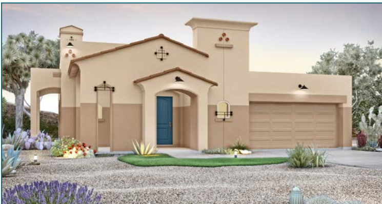
ENCINITAS Spanish Mission Elevation