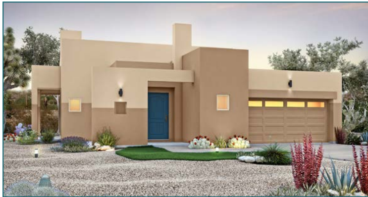
ENCINITAS Contemporary Elevation