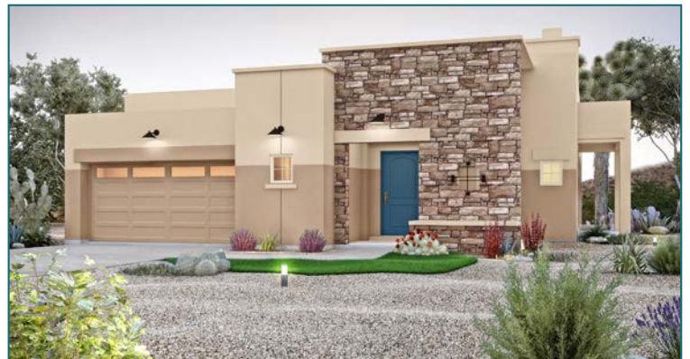
CORTEZ Tuscan Elevation