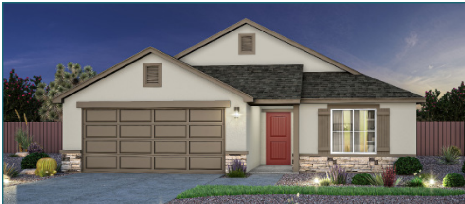
EAGLE with Elevation 2