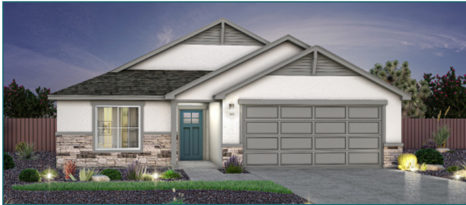
EAGLE with Elevation 1